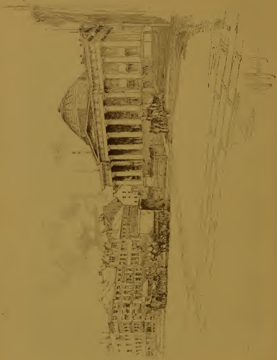
Crown Coffee House Site and the Custom House in 1901 Showing Site of Board of Trade Building